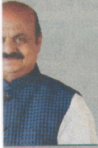
ಎಸ್. ಬೊಮ್ಮಾಯಿ ಬಿಜುಮಂತ್ರಿಗಳು