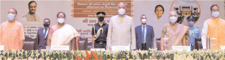
राष्ट्रपति राम नाथ कोविन्द लखनऊ में कैप्टन मनोज कुमार पाण्डेय उत्तर प्रदेश सैनिक स्कूल के हीरक जयंती उत्सव के समापन समारोह में भाग लेते हुए।

इस अवसर पर राष्ट्रपति ने कहा कि डॉ समूपानंद पहले मुख्यमंत्री थे, जिन्होंने सैनिक स्कूल की स्थापना के बारे में सोचा। उनके मस्तिष्क में यह कल्पना रही होगी कि देश का शासन