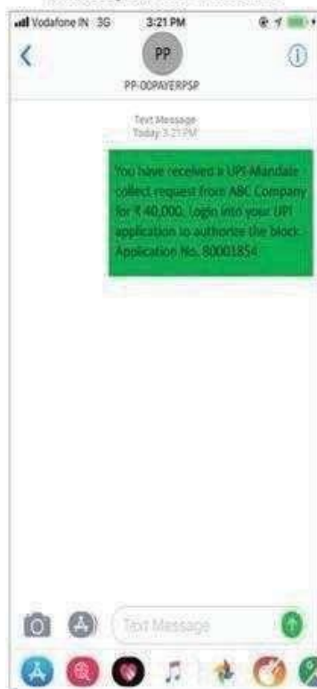
Block request SMS to investor