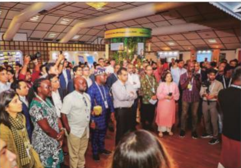
Delegates at the G20 Sherpas' meeting in Kumarakom, Kerala, on Thursday