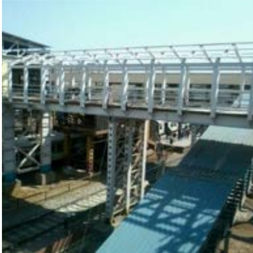
Construction of foot Over Bridge