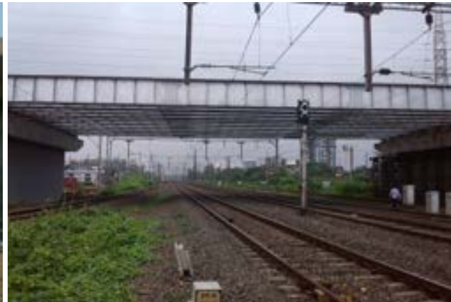
Construction of Road Over Bridge