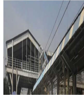
Construction of FOB's, Booking Office & Platform