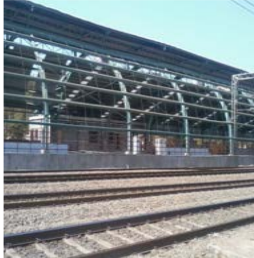
Construction of PEB Platform