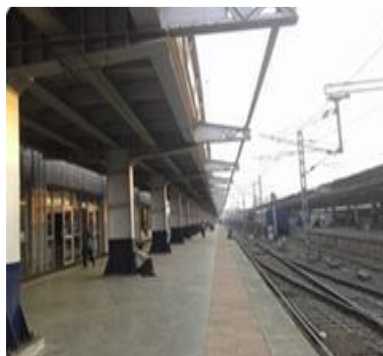
Construction of platform along with Pit lines