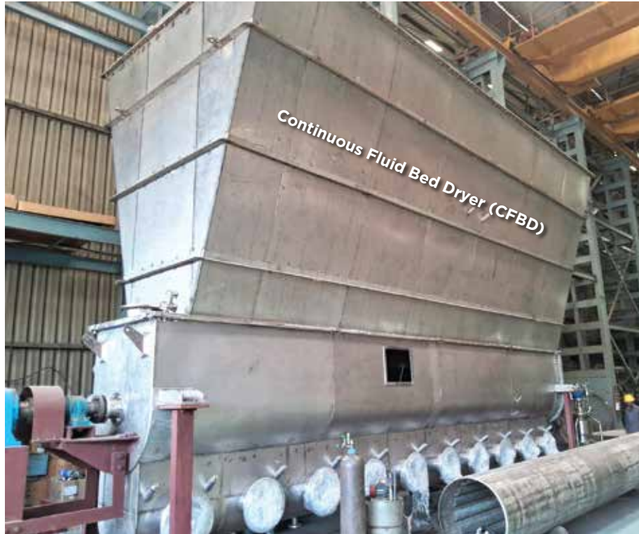
Continuous Fluid Bed Dryer (CFBD)

Pursuant to Regulation 34(2) (e) of the Securities and Exchange Board of India (Listing Obligations & Disclosure Requirements) Regulations, 2015 the Board of Directors are hereby presenting the Management Discussion and Analysis Report.