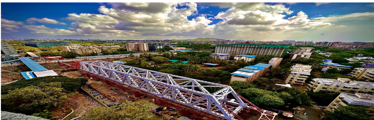
(Actual Photo of the Project at ROB at Vidyavihar Railway Station connecting LBS Marg to RC Marg in 'N' Ward.)