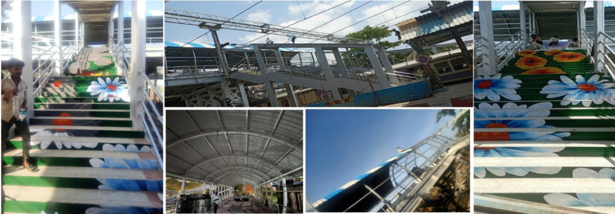
(Actual Photo of Central Railway - Construction of FOB On Station Between Chatrapati Shivaji Terminus Kalyan On Central Line & Chatrapati Shivaji Terminus -Parvel on Harbour Line Section)

The Central government has provided Rs. 11,11,111 crore for the Capital Expenditure. This would be 3.4 % of our GDP. Budget 2024. In the latest budget announced in February 2024, capital expenditure for Financial Year (FY) 2024 - 25 (April 1st, 2024 - March 31st, 2025) stood at INR11.1 trillion ($133.7 billion), an increase of 11.1% compared with Fy2023-24 Budget expenditure. India's infrastructure sectors poised for strong growth, with investments worth US$1.4 trillion planned by 2025 under the National Infrastructure Pipeline (NIP). Senior executives from the sector emphasize that differentiation is crucial in a crowded marketplace, and that companies must stand out to attract more investment in Indian infrastructure. GIFT City model emerges as a compelling option, offering innovative avenues for infrastructure financing and attracting foreign direct investments (FDIs). Indian infrastructure is drawing interest from a diverse range of investors, spanning both strategic and financial sectors. Deal structures encompass the entire spectrum from straight equity to structured capital and debt. Successful exits have been seen, and as the regulatory framework matures, deal sizes are also scaling up