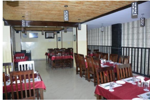
Hotel Debock Inn

Hotel Debock Inn, Deoli ,Tonk delivers exceptional service, artful decor and an array of luxury amenities with unparalleled environment responsibility. With a refreshing mix of Indian heritage and high-tech hospitality, Hotel Debock Inn, Deoli is a leading environmentally sensitive business hotel in Tonk, Rajasthan. Hotel Debock Inn gives all gives services like 24-hour concierge & front desk, Wake-up calls, Taxi Arrangement, Dr. On Call ,24hr room service, Green and open surroundings, Rich design, Spotless and very much kept up rooms and hygienic food available in hotel. The offices are cutting edge and tuned in to the times, the climate is casual and the staff very friendly and soft spoken nature with every client.