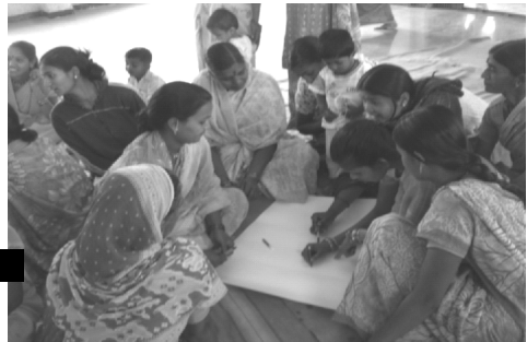
■ Health Awareness