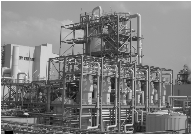
Biowanze SA (Belgium), 758 m 3 /day bioethanol plant