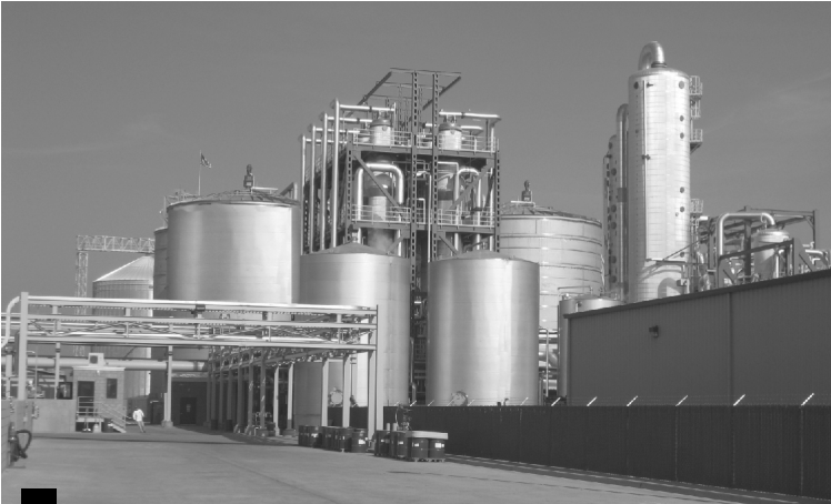
55 mgpy corn based plant at Keyes, California for Cilion (AE Biofuels)