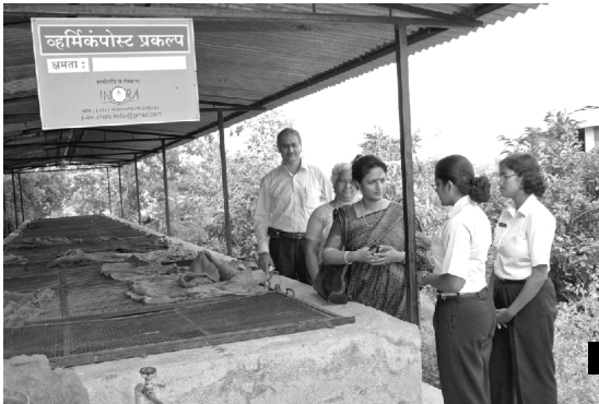
■ Clean City