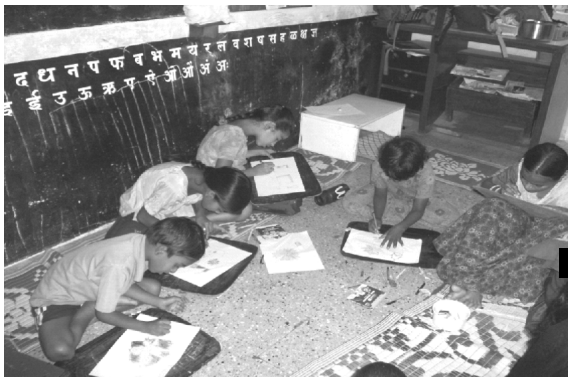
■ Directing Non School going children