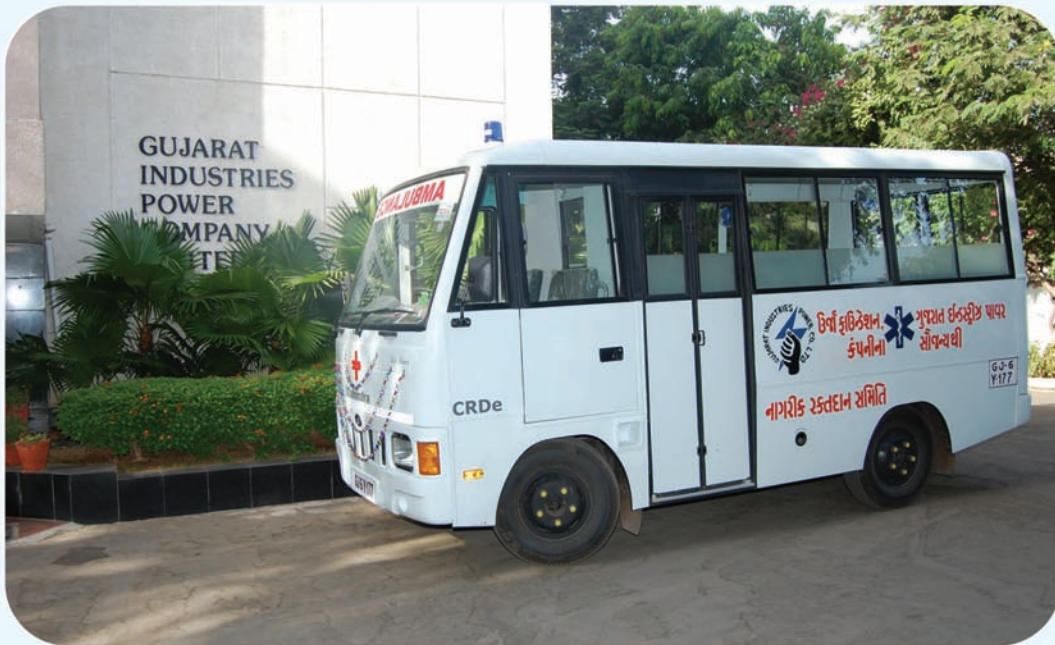
Ambulance Van donated to Citizens Blood Donation Society, Vadodara.