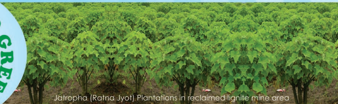
Jatropha (Ratna Jyot) Plantations in reclaimed lignite mine area