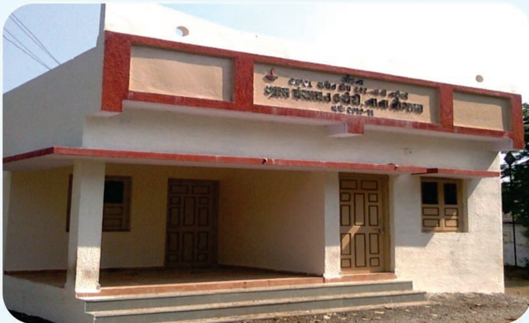
Panchayat Ghar, Village Nana Naugama, Taluka: Mangrol, Dist.: Surat.