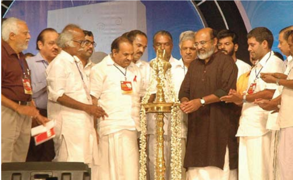
Inaugural function of Federal Bank Grand Kerala Shopping Festival, held at Kannur. The traditional lamp is lit by Shri. Thomas Issac, Finance Minister in the presence of Shri. Kodiyeeri Balakrishnan, Home Minister, our MD & CEO etc.