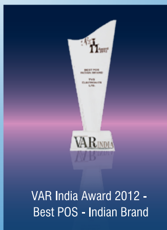
VAR India Award 2012 - Best POS - Indian Brand