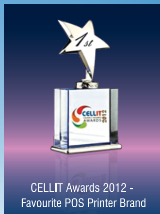
CELLIT Awards 2012 - Favourite POS Printer Brand