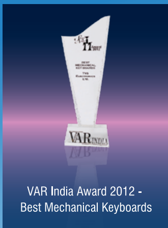
VAR India Award 2012 - Best Mechanical Keyboards