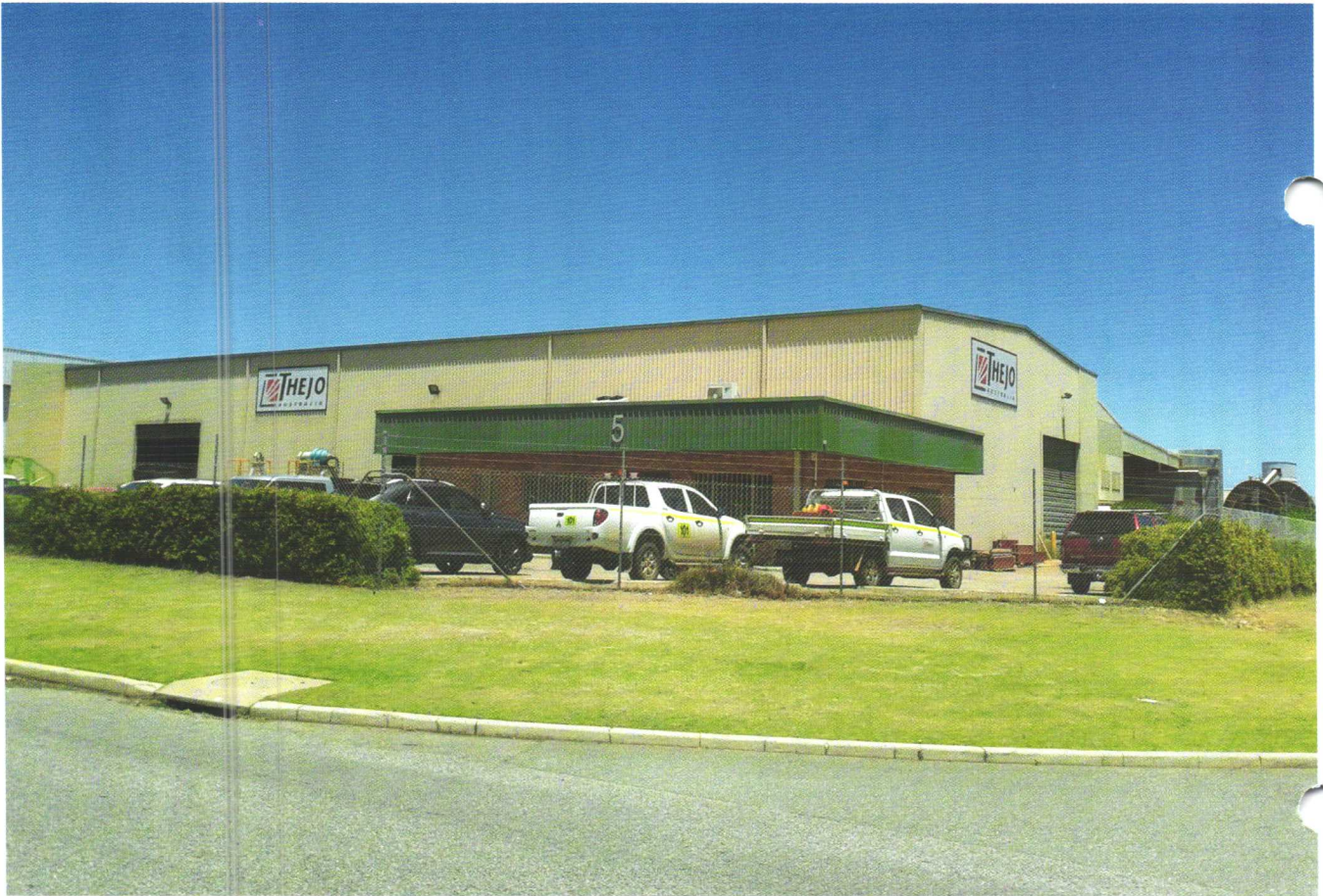
Perth Office of Thejo Australia Pty Ltd.