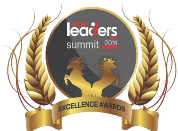
ASIS'S FASTEST GROWING MARKETING BRANDS, WCRC-204