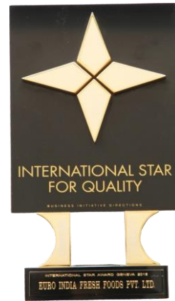
INTERNATIONAL STAR FOR QUALITY AWARD - GENEVA - 2015