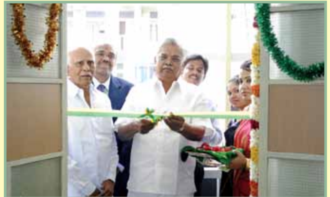
◀ MAHESANA – GUJARAT