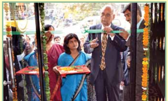
◀ ATM at GITAM UNIVERSITY – A.P.