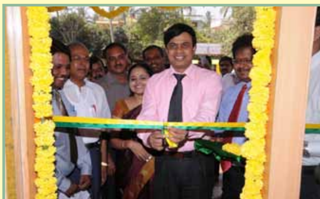
NELAMANGALA – KARNATAKA ➤