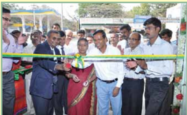
DELHI – KAMLA NAGAR ➤