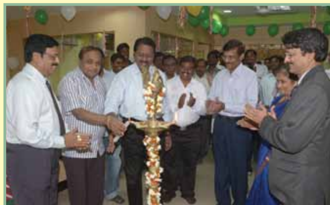
KOTHAGUEDEM – A.P. ➤