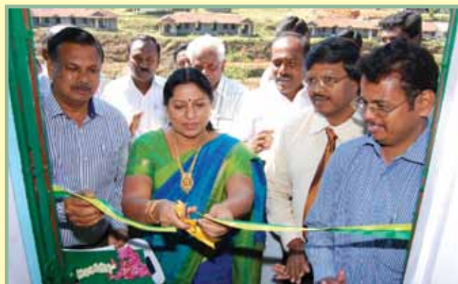
➤ BANJARA HILLS – HYDERABAD