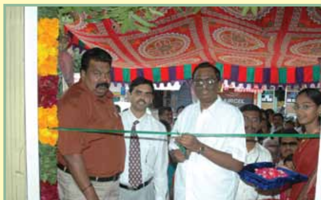
HARUR – TAMILNADU ➤