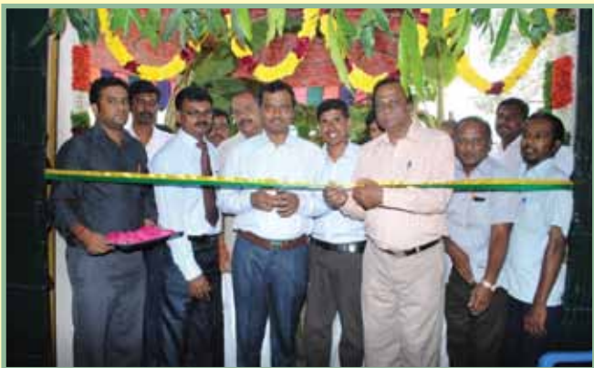
VEDASANDUR – TAMILNADU ▶