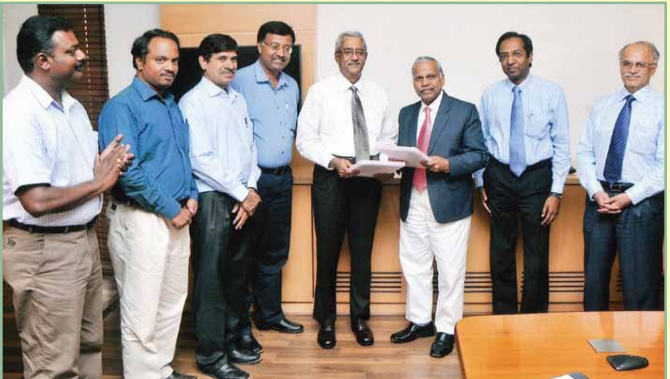
MoU with Ashok Leyland for marketing commercial vehicles