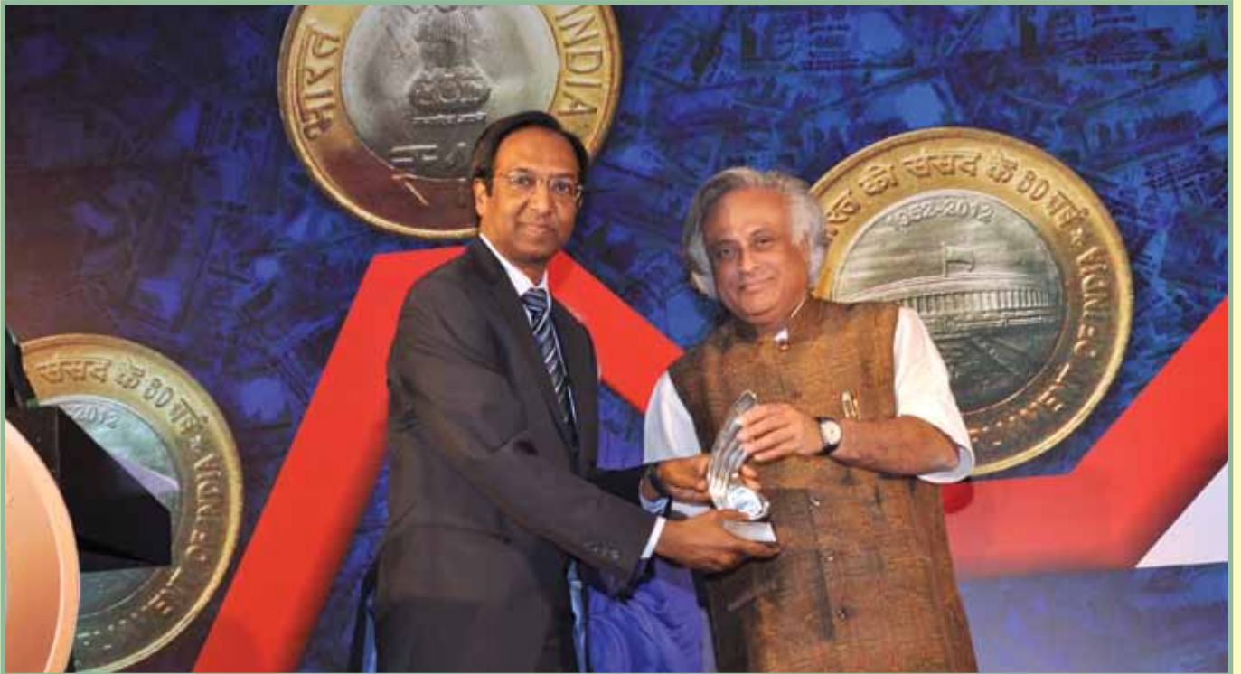
“Best Small Bank” award received from Shri. Jairam Ramesh, Hon’ble Minister for Rural Development - Business World Price Waterhouse Coopers Awards, 2012