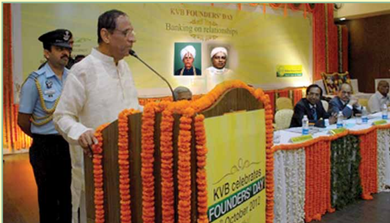
Address by His Excellency Shri E S L Narasimhan, Governor of Andhra Pradesh