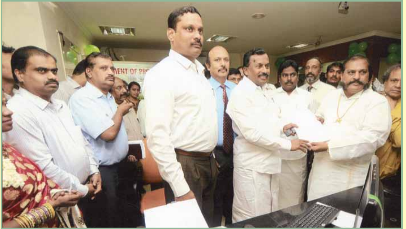
Collection of Property Tax through our branches and ATMs for Chennai Corporation