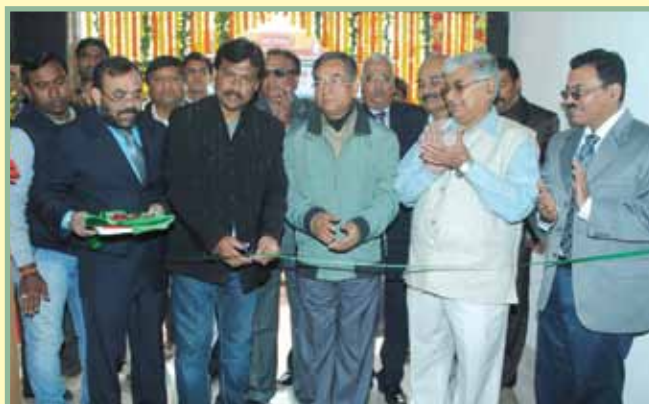
DURGAPUR – KOLKATA ➤