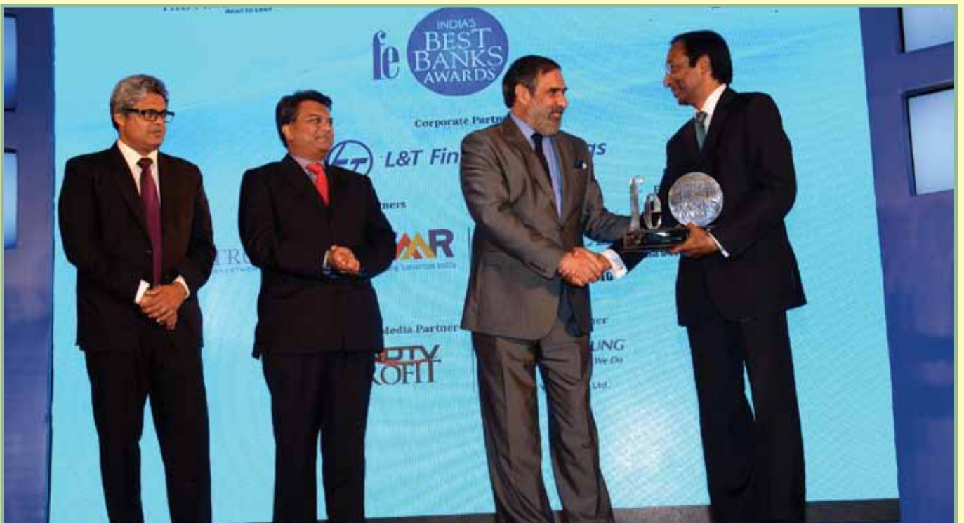
“Best Old Private Sector Bank - Runner Up” award received from Shri. Anand Sharma, Hon’ble Minister for Commerce and Industry - Financial Express Awards, 2012