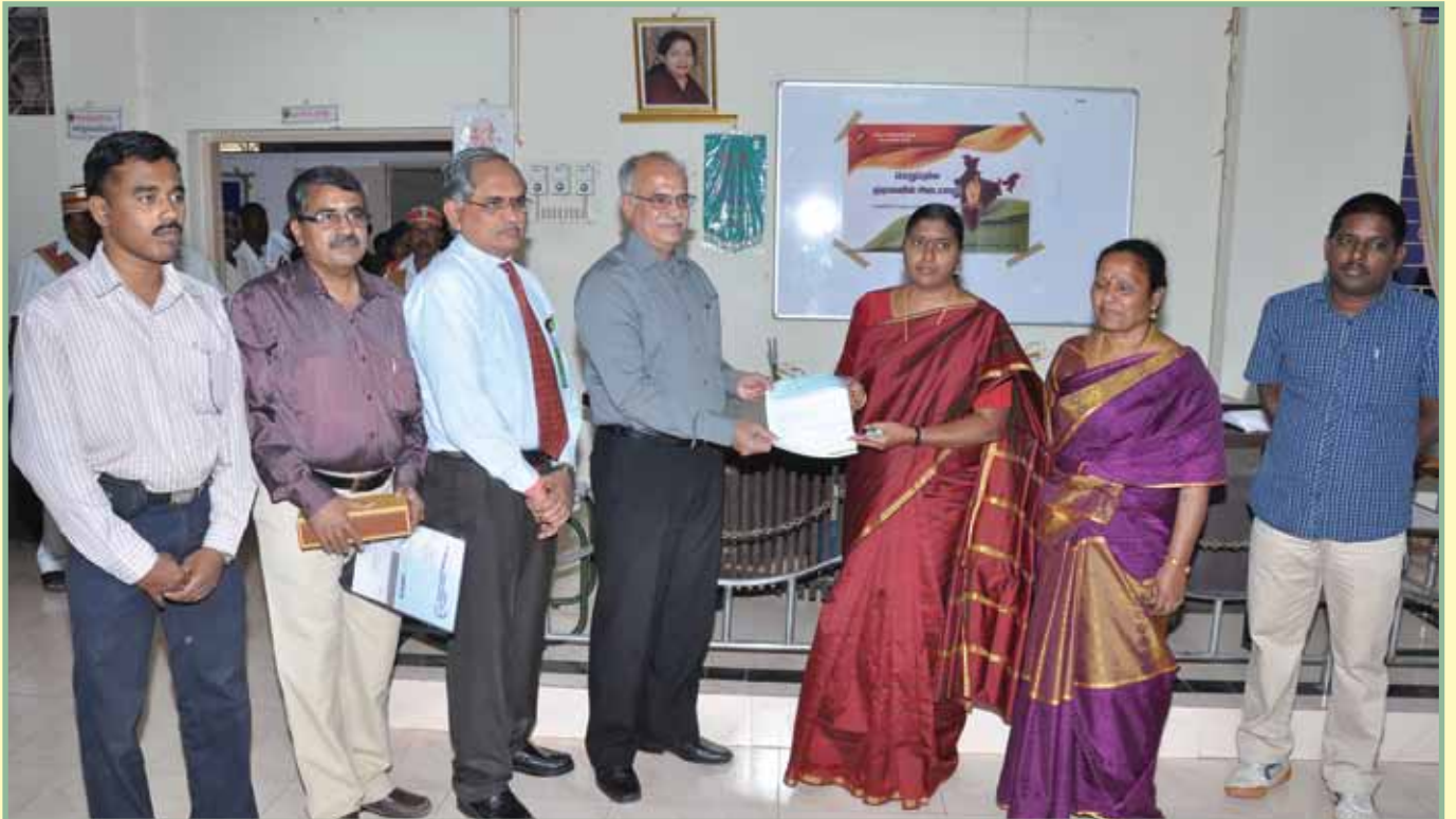
Donation for severely underweight children handed over to Karur Collector