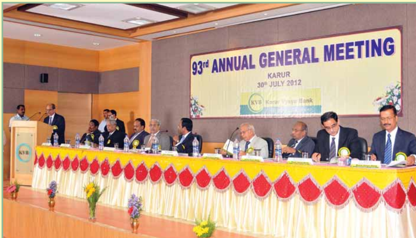
93 rd ANNUAL GENERAL MEETING