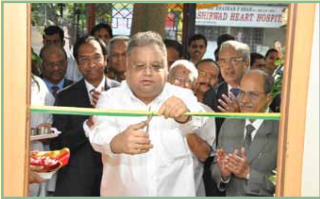
◀ GHATKOPAR – MUMBAI – 500 th BRANCH