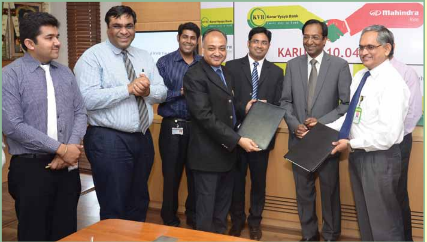
MoU with Mahindra for marketing Mahindra passenger and commercial vehicles