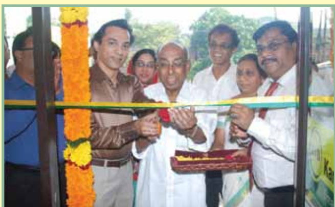
◀ KANNUR – KERALA