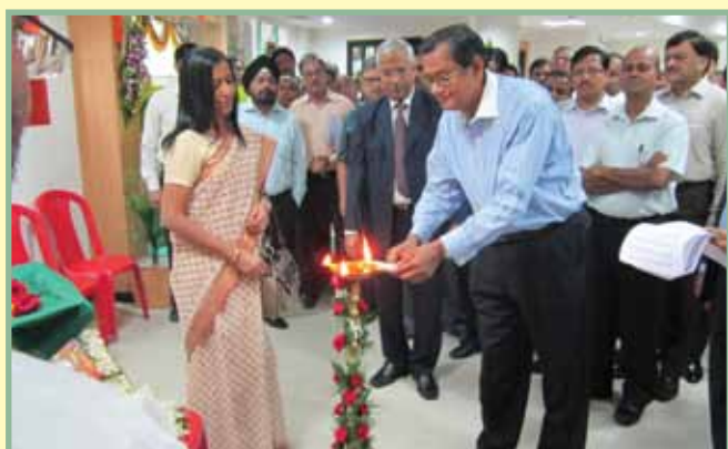
➤ KOLKATA – N.S. ROAD